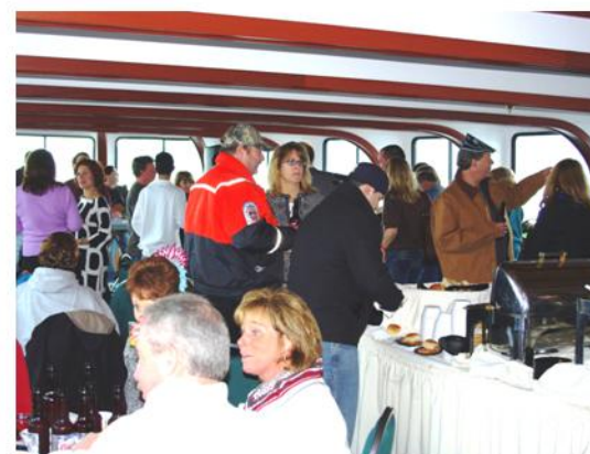
Eat, drink, be merry!

Happy New Year indeed! New Year's Day found a group of LGPS celebrating aboard the LG Shoreline Cruises' Adirondac. "The 1½ hour "Frostbite Cruise" featured a buffet lunch, music by Blues Highway, a cash bar and, best of all, the camaraderie of getting together with good friends, And on the water, to boot.