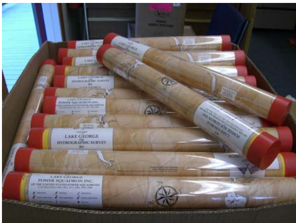
New 2008 Charts ready for distribution