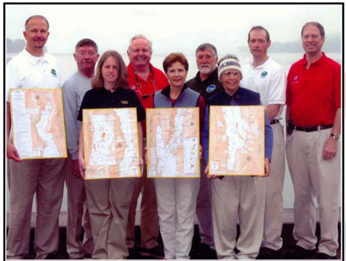
Chart Committee unveils new 2008 LGPS Chart