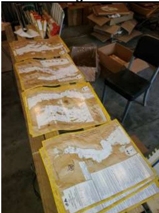
Chart Rolling Assistance Needed

Did you notice the empty chair in the photo to the left? What's missing in that picture? You are!