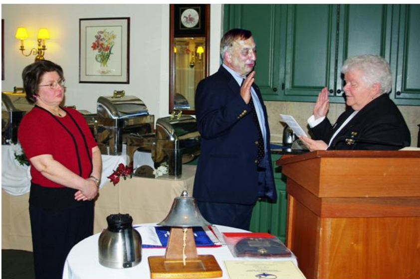
Squadron, current and new squadron members, and guests.